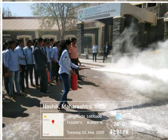
Awareness & Training Regarding Fire Safety on March 3, 2020